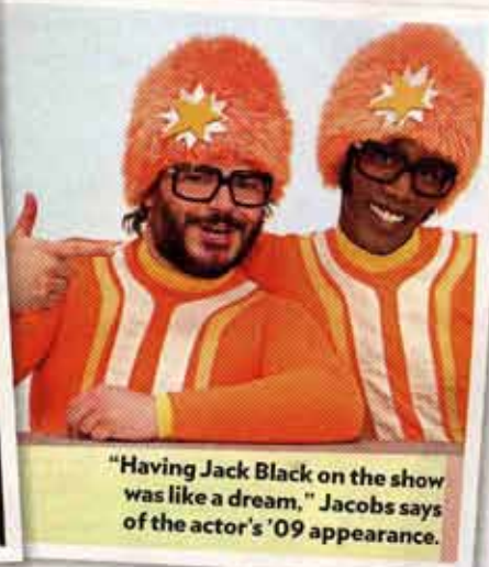
"Having Jack Black on the show was like a dream," Jacobs says of the actor's '09 appearance.